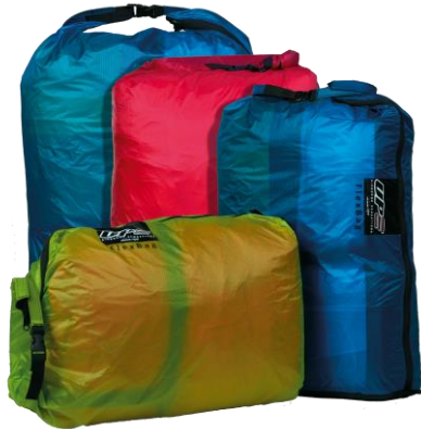
Figure 4: UP FlexBag (scope of delivery: 1 piece in the corresponding size)